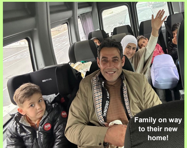
Family on way to their new home!