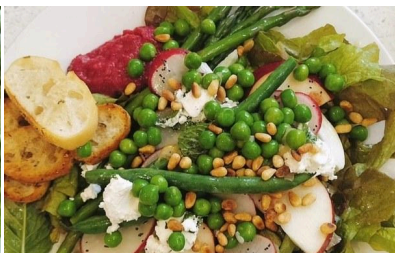
A celebration of Spring