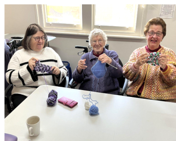
Friday mornings with the Craft & Cuppa Group - See Page 3