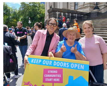
Standing up for neighbourhood houses the “Keep Our Doors Open” rally