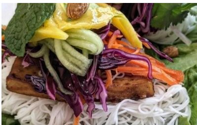
Miso/hoisin glazed tofu