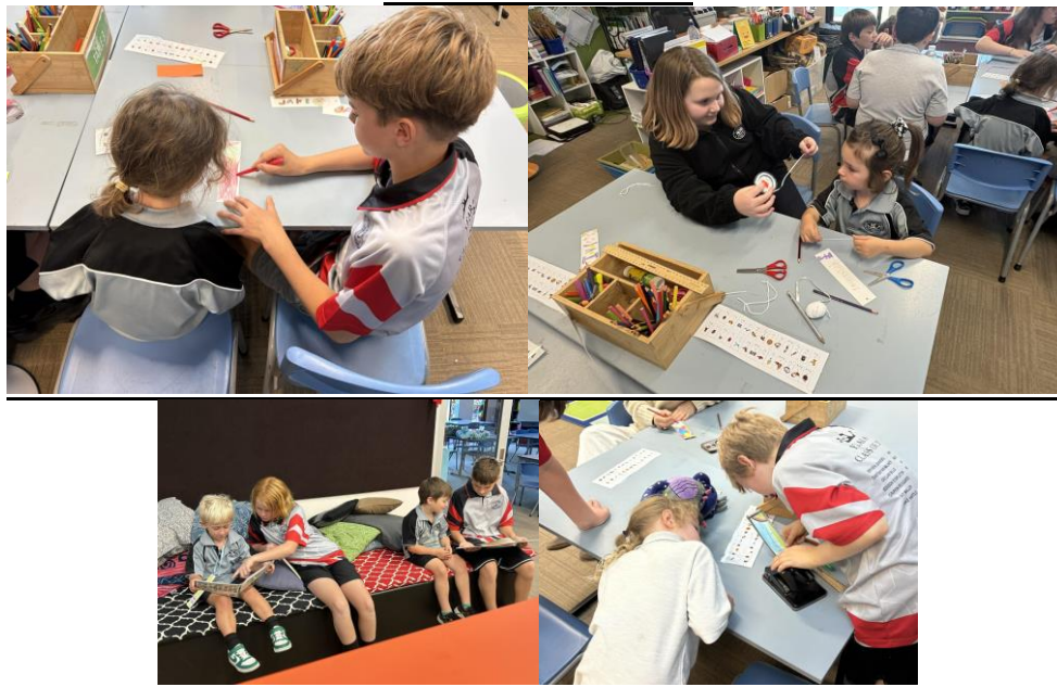
(Enjoying buddy time)