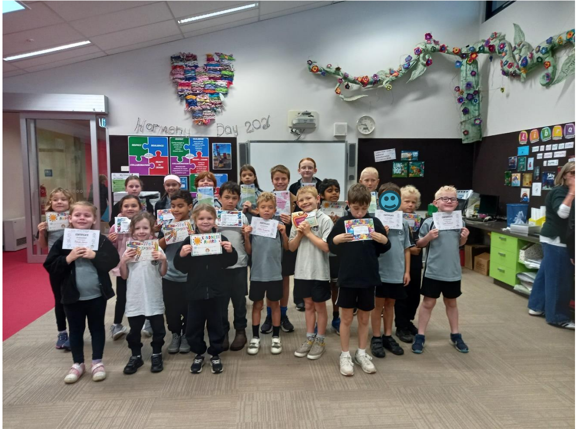
Grip Leadership attendees with their Certificates