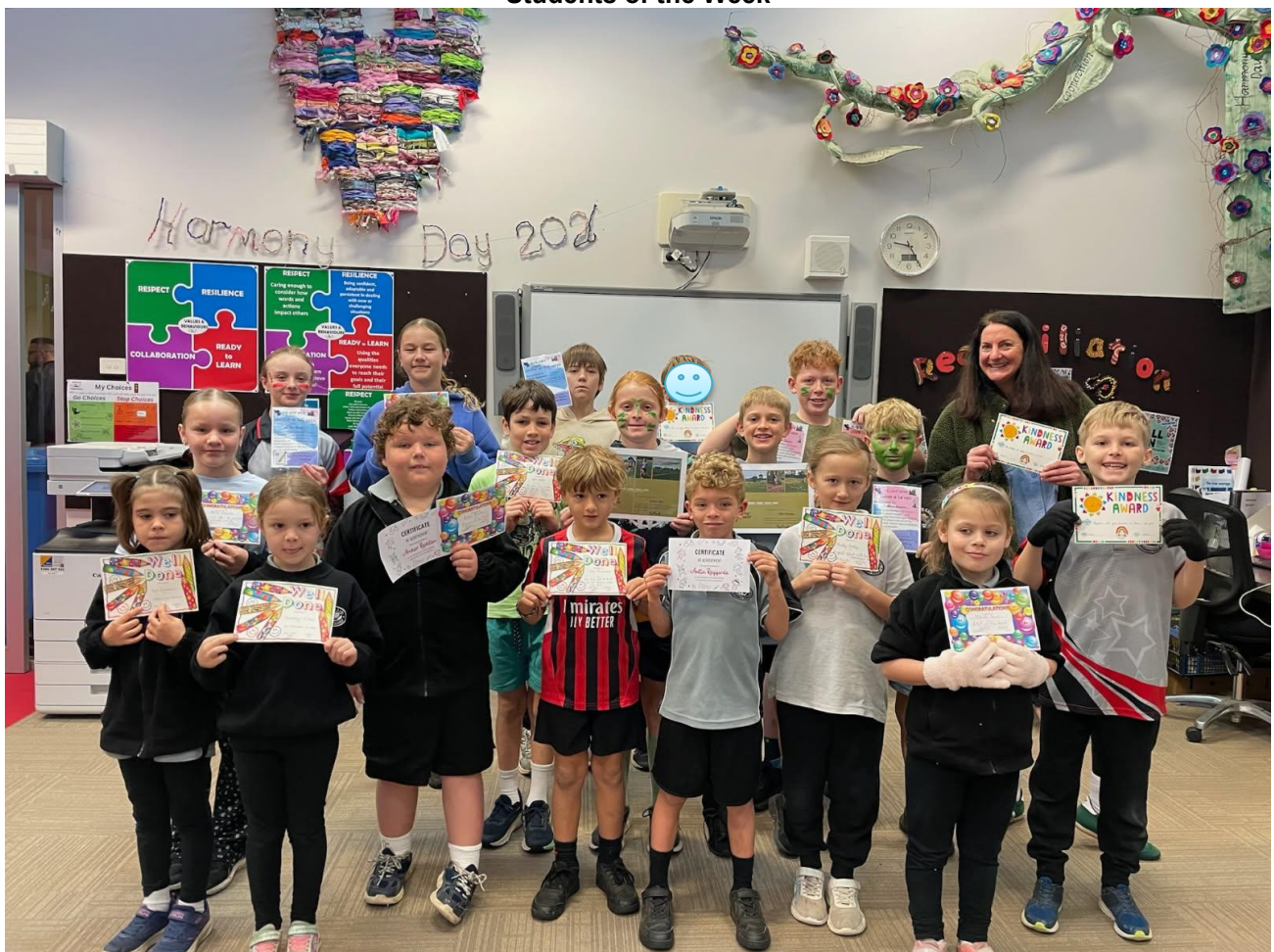
"Learning Together, Succeeding Together"