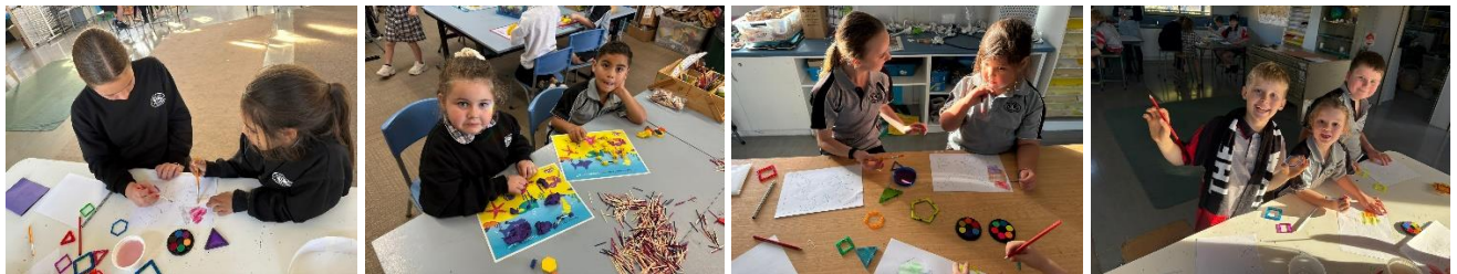
(making shape pictures in a shape math session and abstract shape watercolours with our buddies)