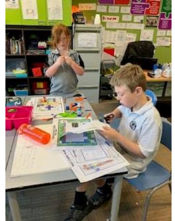
Photos of students in 3/4 A completing their math's obstacle course projects.

Please remember hats are compulsory this term. If your child does not have a school hat, they are available at the office for $8.00.