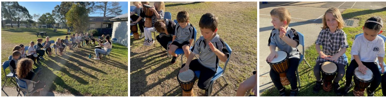
P/1 students learning to drum on djembes in the sunshine.