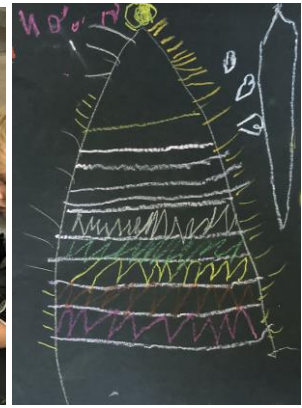
Miss Cock's class exploring the idea of 'landmarks at night'.