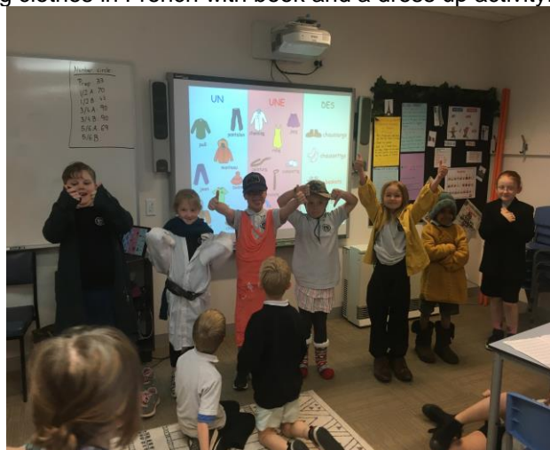
"Learning Together, Succeeding Together"

1/2 keep on practising naming clothes in French with book and a dress up activity.