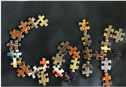
Upcycling 'puzzle art' by Ollie Douglas