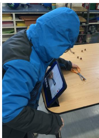
Junior Students working on their stop motion animation.