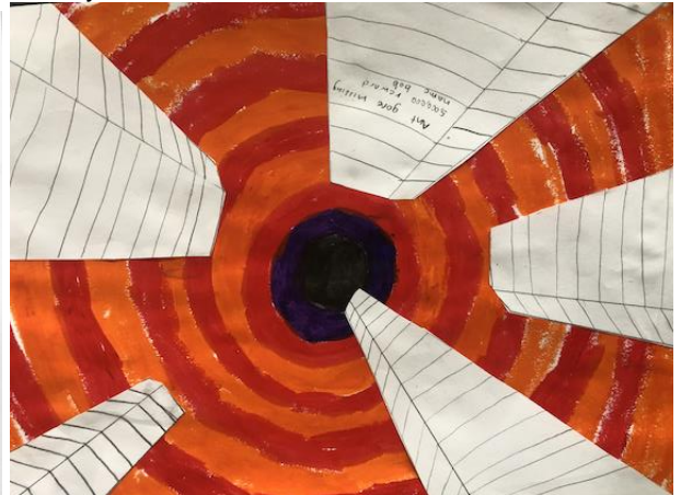
'Worm's eye view' artwork by Zeppelin Allan.