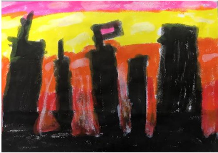
Finished artwork by Luna Sutherland.