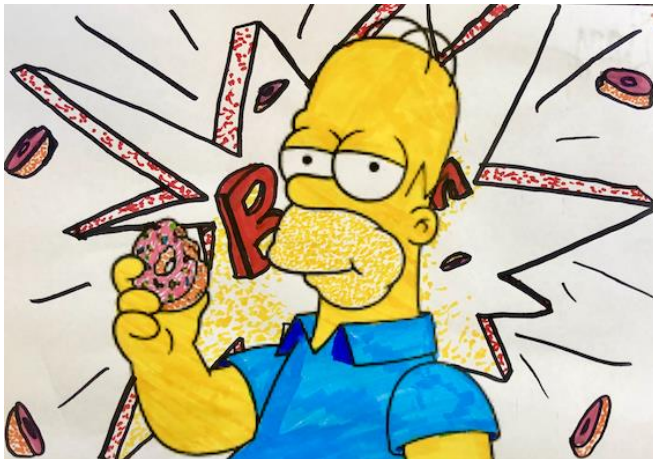
'Pop Homer' by Ruby Pool.