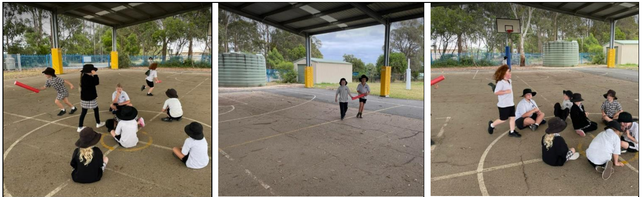
Grade 1/2s having fun playing Dog Pound