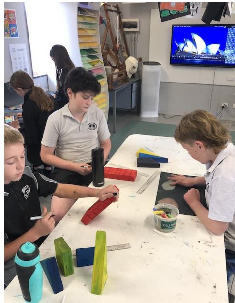
Senior Students working in both two and three-dimensions.