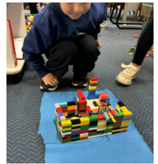
How to move a zoo STEM challenge