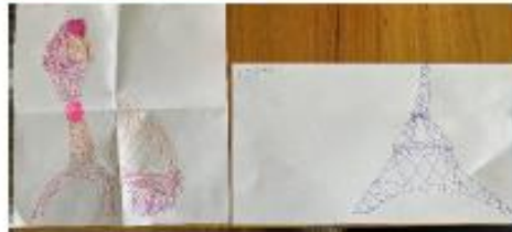
Sienna's little sister Elise wanted to get in on the act too! They both had a go at drawing the famous Eiffel Tower.