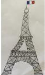
Who needs to go visit the Eiffel Tower when you have one in your lounge room? Thanks Ava