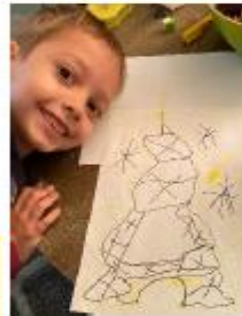
Elijah looks very impressed with his drawing of the Eiffel Tower.