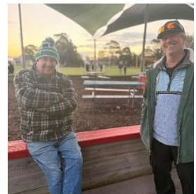
More photos further in the newsletter.