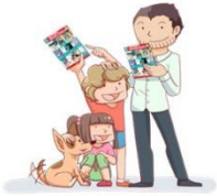
Families order from Book Club.

Every purchase you make earns your child's school 15% of your order value in Scholastic Rewards that can be used to purchase valuable educational resources that benefit your child.