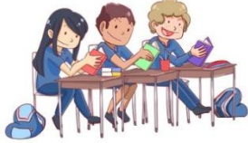
The school earns Scholastic Rewards.