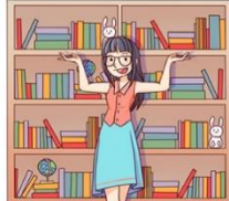
The school redeems Scholastic Rewards for additional resources