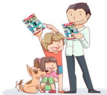
Families order from Book Club.

Every purchase you make earns your child's school 15% of your order value in Scholastic Rewards that can be used to purchase valuable educational resources that benefit your child.