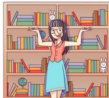
The school redeems Scholastic Rewards for additional resources