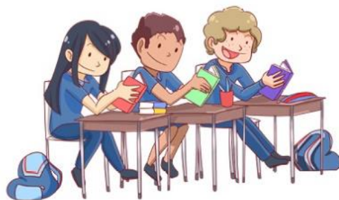
The school earns Scholastic Rewards.