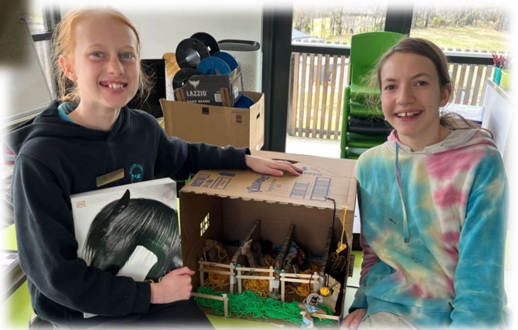
MARC Van Shenanigans