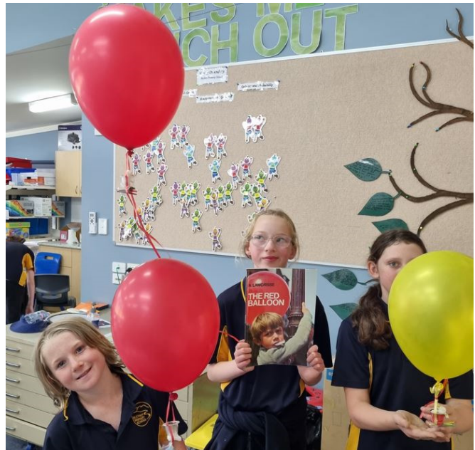
Seniors with floating balloons.