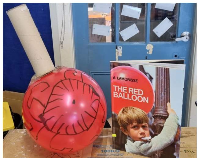
Tom's balloon with top hat.