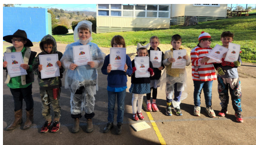
25 NIGHTS OF READING