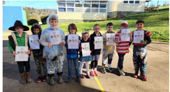
50 NIGHTS OF READING