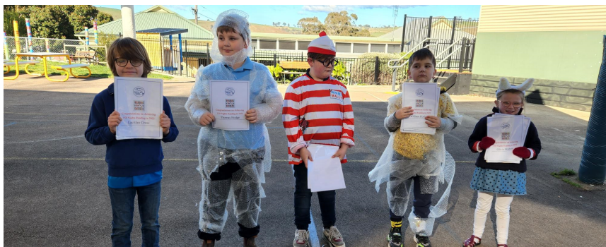
150 NIGHTS OF READING