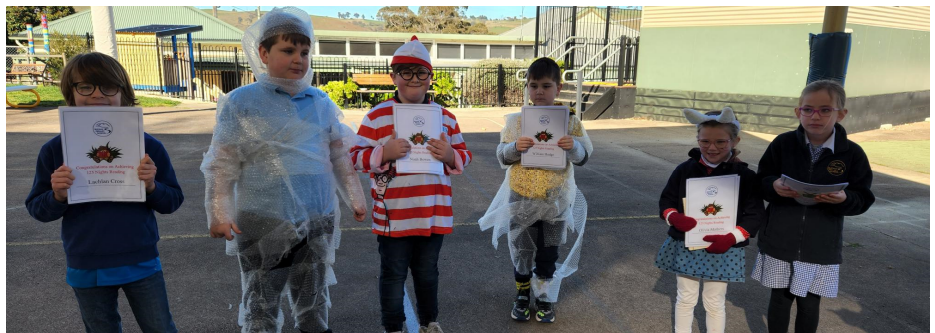
125 NIGHTS OF READING