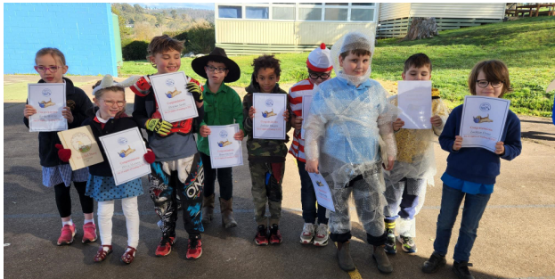
75 NIGHTS OF READING