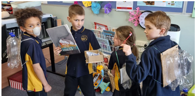
Walk of the whales rescue crew.