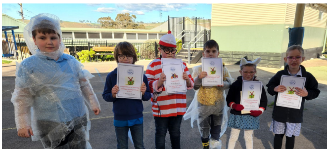
100 NIGHTS OF READING