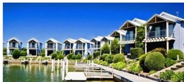
Captains Cove, Paynesville Ph 5156 7223