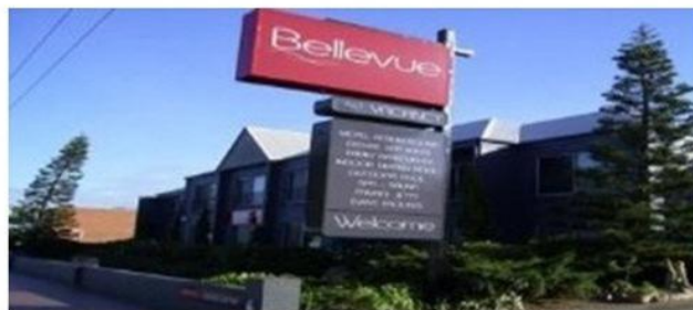
Bellevue on the Lakes L Entrance Ph 5150 9488