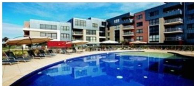
The Esplanade Resort, L Entrance Ph 5150 9600