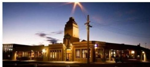
The Central Hotel Motel, L Entrance Ph 5155 1977